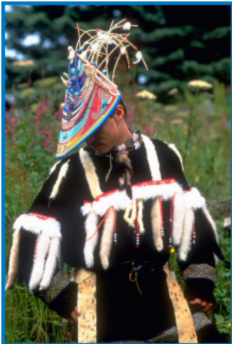
A modern Alutiiq dancer in traditional festival garb.

•What do they call mosquitoes in Alaska? An Alaskan Horse.