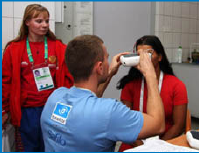
Lions Clubs International

A volunteer exams the vision of a Special Olympics' athlete during an Opening Eyes screening.